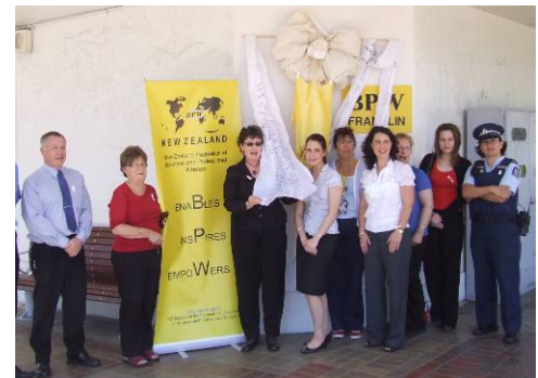
Right: BPW Franklin, White Ribbon